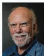
Barry C Barish