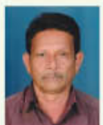
FOND FAREWELL TO