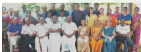
Third batch (1983-86) alumini meet on 12th August 2017