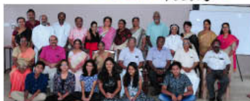
Alumini meet of fourth batch (1984- 87) was conducted on 20th May 2017