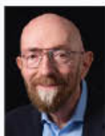
Kip S Thorne